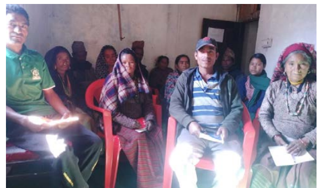
Photos from the Awareness Program