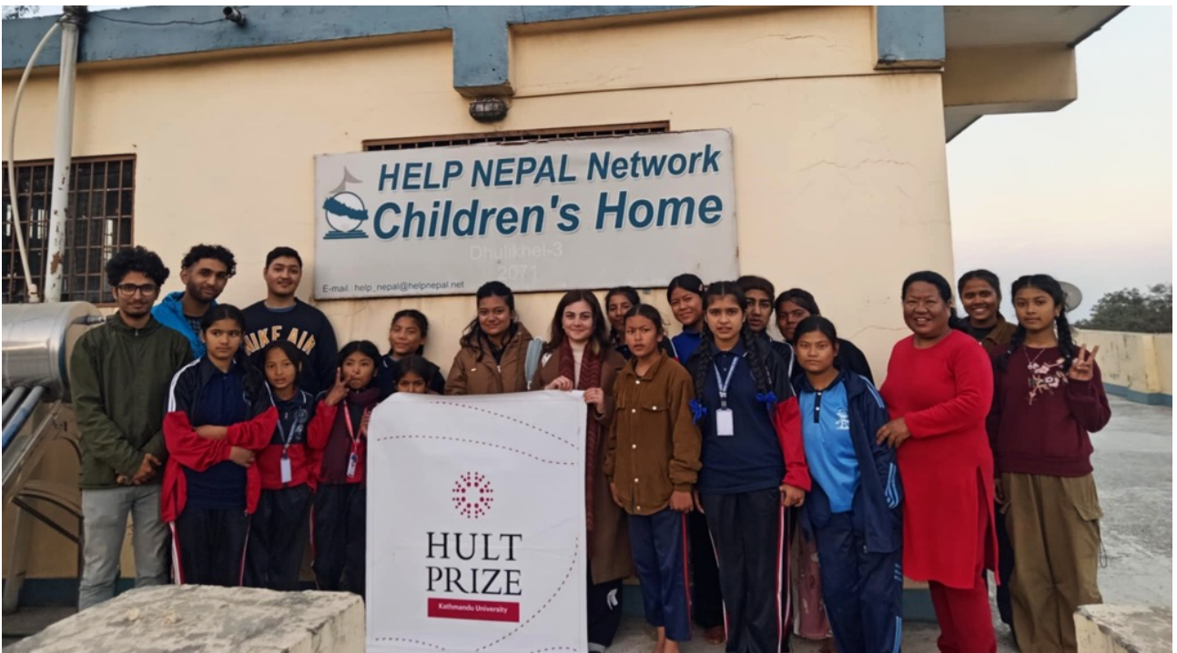
Gifts from Kathmandu University (KU) students to our girls