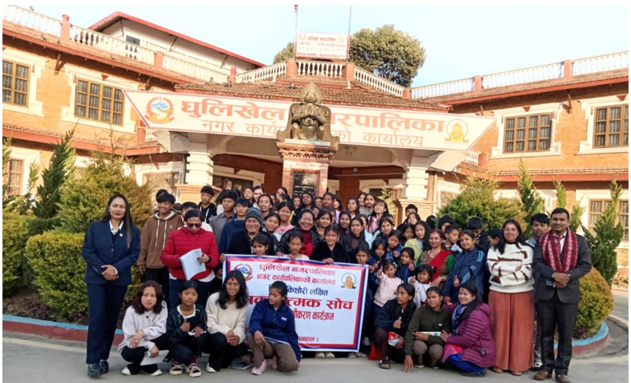
Glimpses from Positive Thinking Program