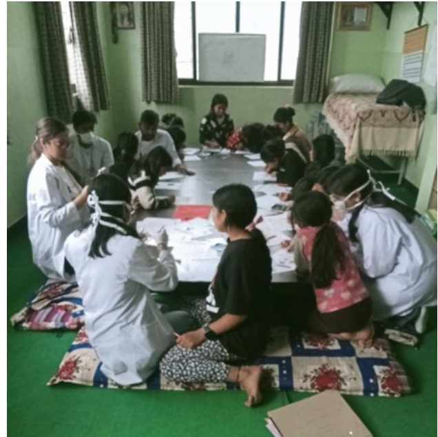
Glimpses of Dental Checkups at Children's Home