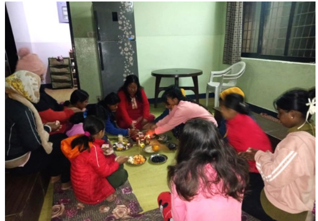
Girls getting excited to explore the Swasthani Book