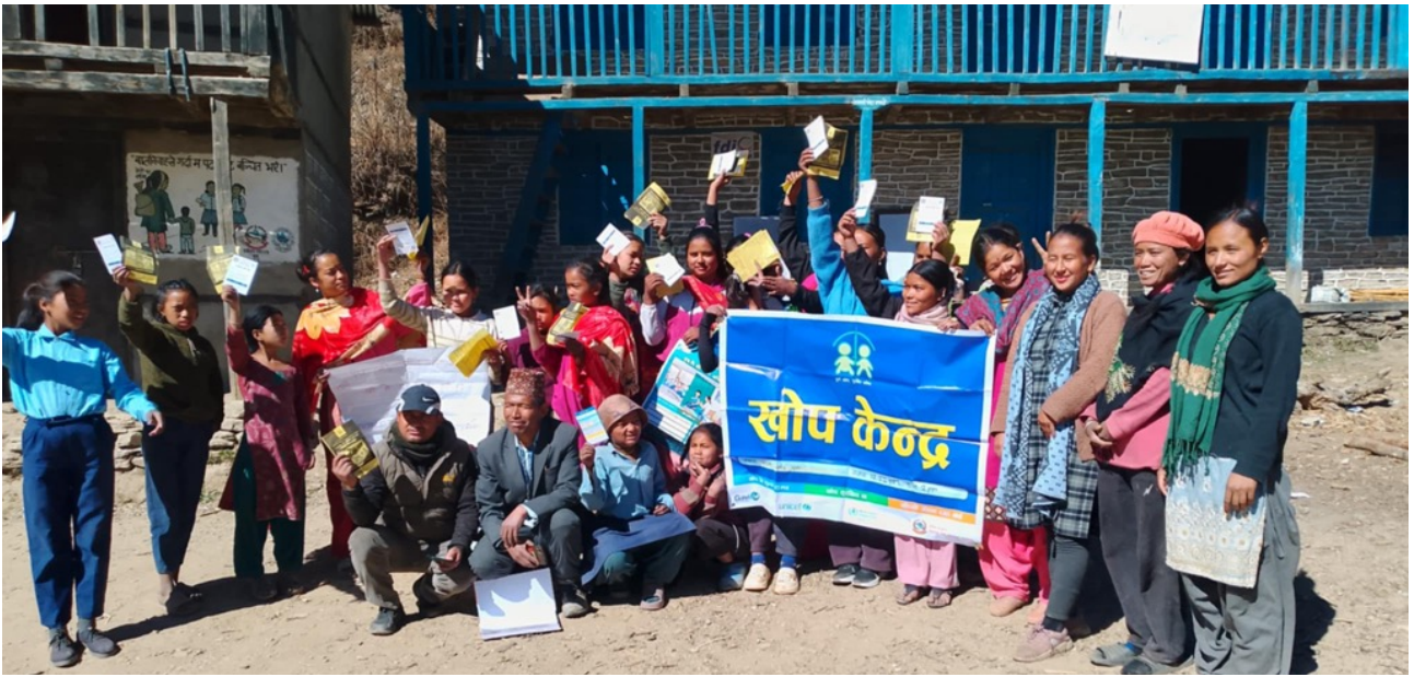
Students from Nepal Karnali Madhyamik Vidyalaya getting HPV vaccination