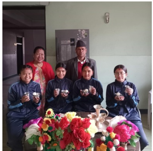
Our girls getting ready for their SEE Examination

hard in their studies, and Children's Home extended every possible help and support to them as they approached this important milestone in their academic journey.