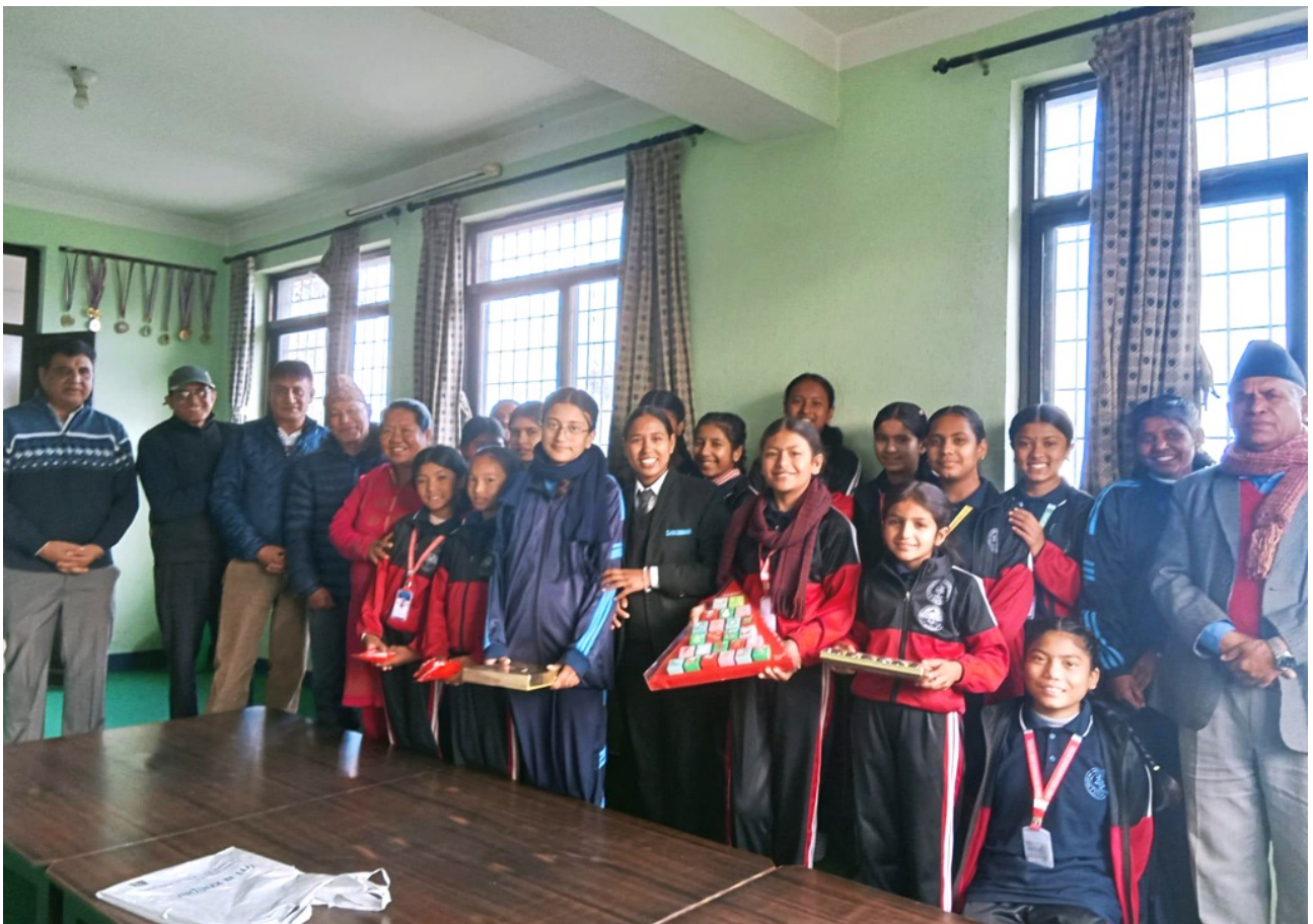
Happy faces after receiving their gifts