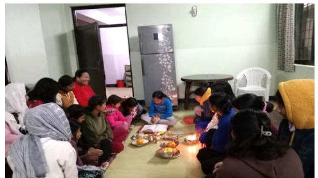
Our girls reading the Swasthani Book