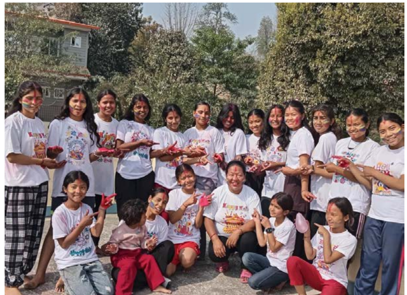
Our girls Celebrating Holi

Our 4 girls from HELP NEPAL Network Children's Home attended their SEE Examination that started from 20th March, 2025. They had been working