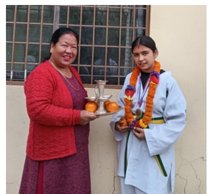
Five champions from HELP NEPAL Network Children’s Home at the Bagmati Province Taekwondo Championship 2081