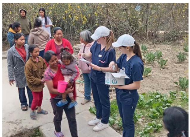
Glimpse from Teeth Awareness Campaign