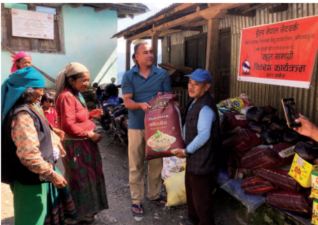
Relief Package distribution for flood and landslide victims in Dolakha