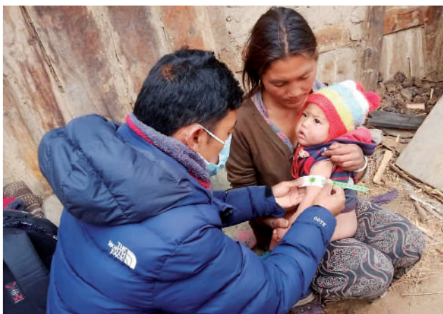
Distribution of Vitamin A capsules and Antiworm medicine to the children in Mugu