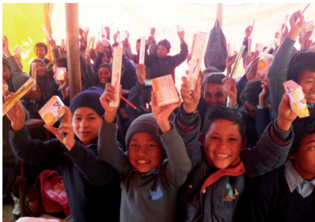
Health & Safety Awareness camp in Mahendra H.S School, Bajura during earthquake.