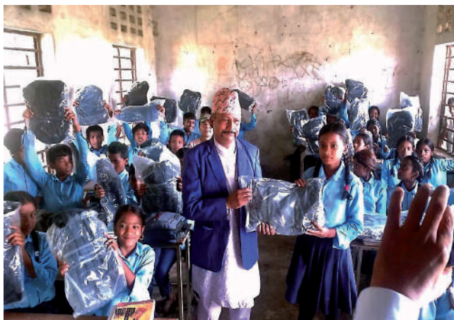
School Bag Donation to 300 students of Shree Nepal Rastriya Basic School, Parsa