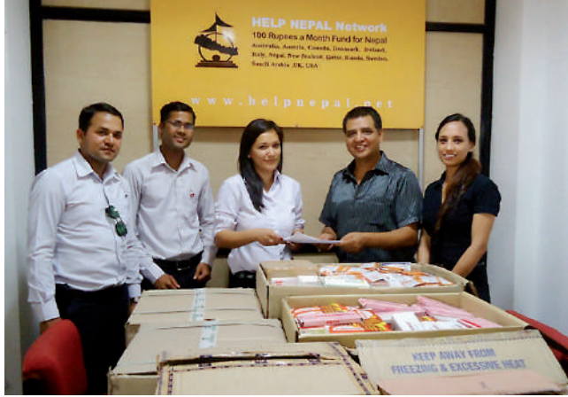
8 boxes Medicines worth 1 lakh handover to Sipradian Sahayata Sanstha for free health camp in Terathum