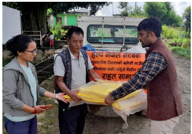
Tampoline distribution for flood and landslide victims in Sindupalchowk