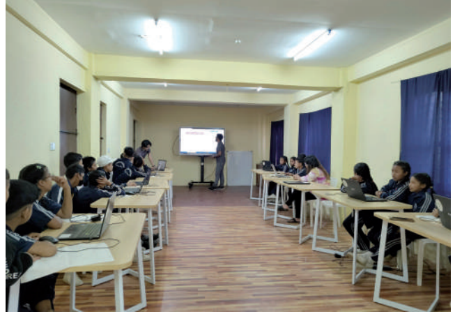
Hi-Tech Classroom At Rajkhuleashowr Lower Secondary School, Dolakha