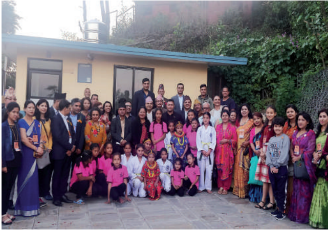
20th years Anniversary Celebration at HeNN Children's Home