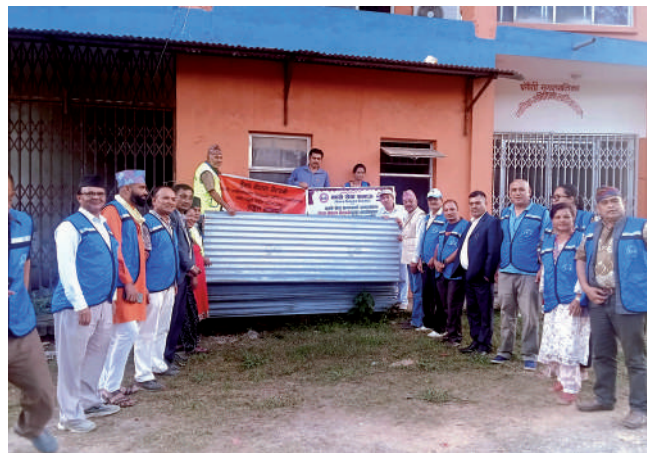
Zinc Sheet for Flood & Landslide Victims in Kavre