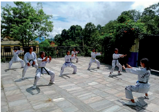
Girls Practicing Taekwondo