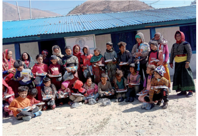
School dress, Hygiene Materials, Computer Set and Stationery items Supported to Women Community Service Society Orphanage Shelter Home, Dolpa