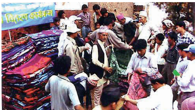
Relief material distribution to Bhojpur fire victims by HeNN