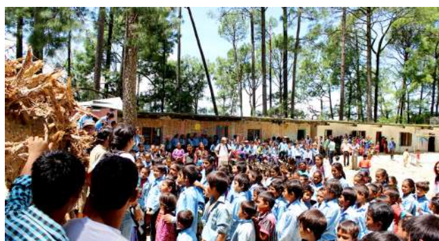
Free Health Checkups During Earthquake in Okharpauwa, Nuwakot