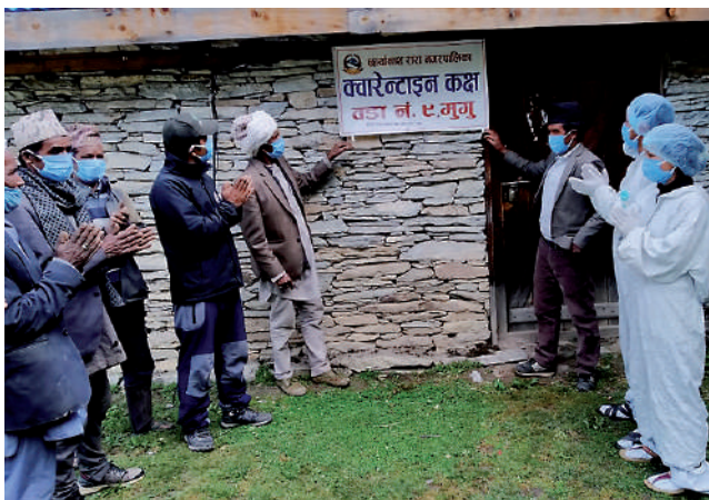
Qurantine Setup in HeNN Health Post, Mugu