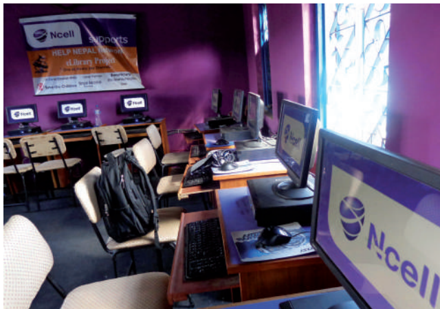
Shree Ganesh Secondary School, Kavre