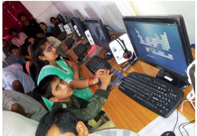
Shree Dashrath Higher Secondary School, Kailali