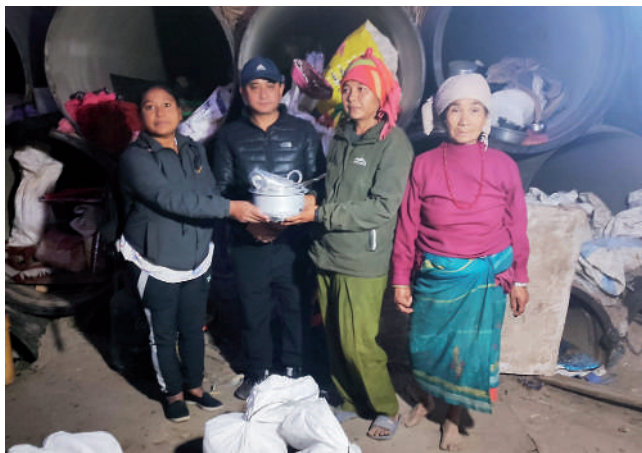
Distribution of Kitchen Utensil Package in Sankhamul, Kathmandu