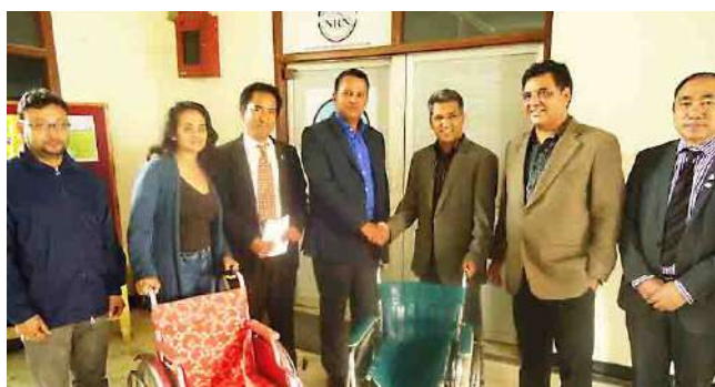
NRN Japan Wheelchair Handover