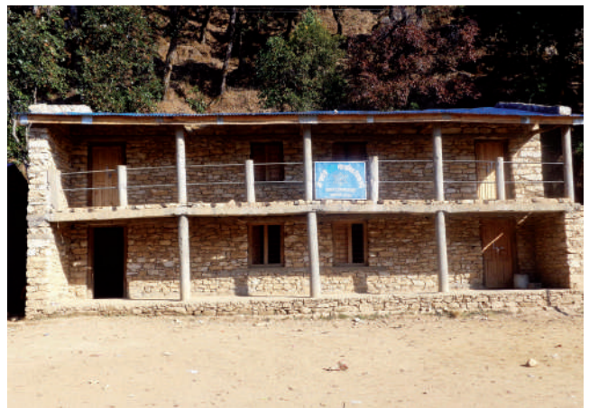
School Building renovation in Shree Parvati Secondary School, Bajura