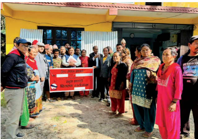
Distribution of Zinc Sheet & Tampoline for Flood Victims in Mandandeupur, Kavre