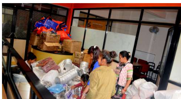
Relief Packages For Saptari and Siraha Fire Victims