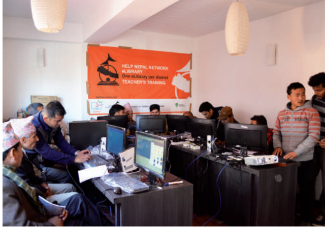
E-library Teachers Training