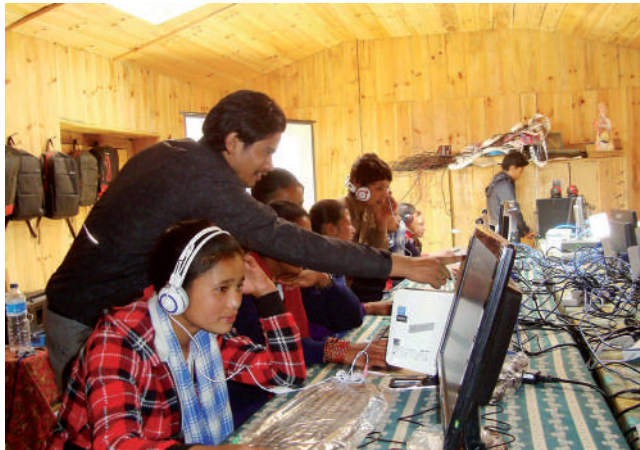
Shree Chanresthan Higher Secondary School, Solukhumbu