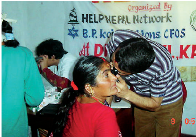
Free Eye Camp, Kavre