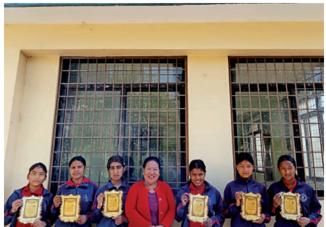
Girls securing 1st & 2nd Position in their Exams