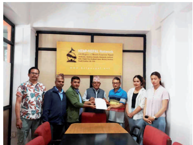
MOU Signed with Panchanyakanya Primary School, Kavre