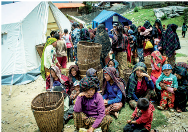
Earthquake Relief for Dhading Baireni Baltar