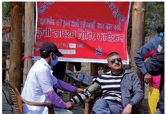
General Health Checkup in Mugu