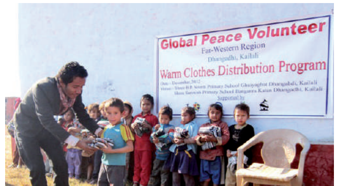
Warm Clothes Distribution Program, Kailali