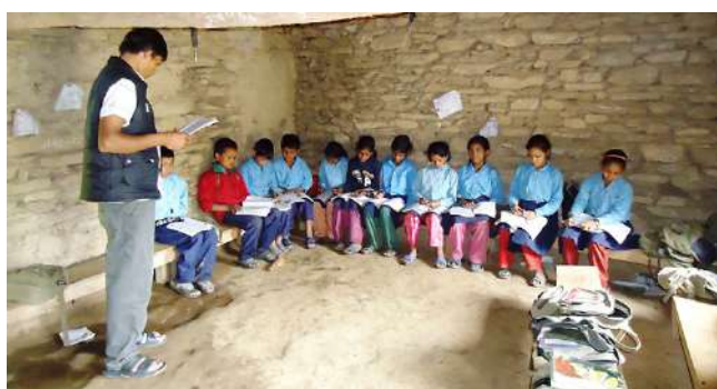
Student of Parvati Secondary School, Bajura, During Earthquake