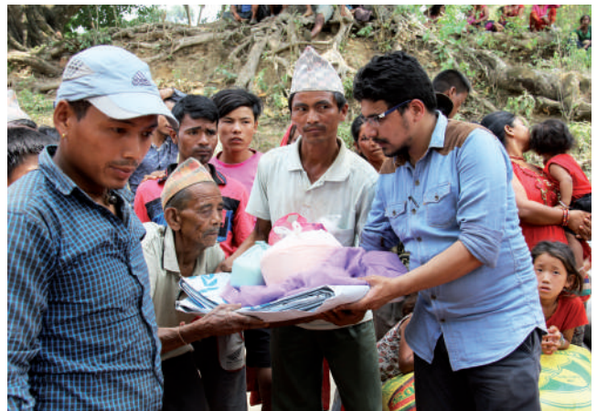
Earthquake Relief for Dhading