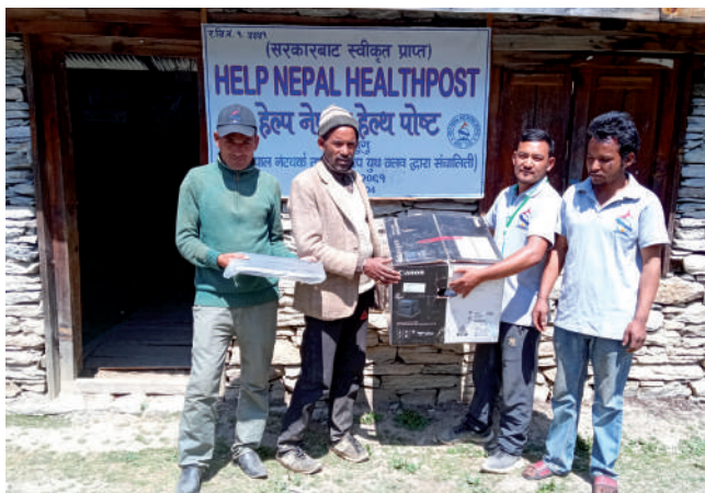
Laptop & 3in1 printer support to Help Nepal Health Post