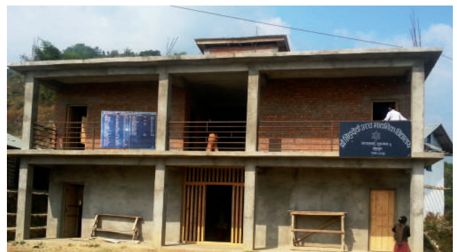
Support to Shree Singhadevi H.S School, Tehrathum to Complete School Building Construction