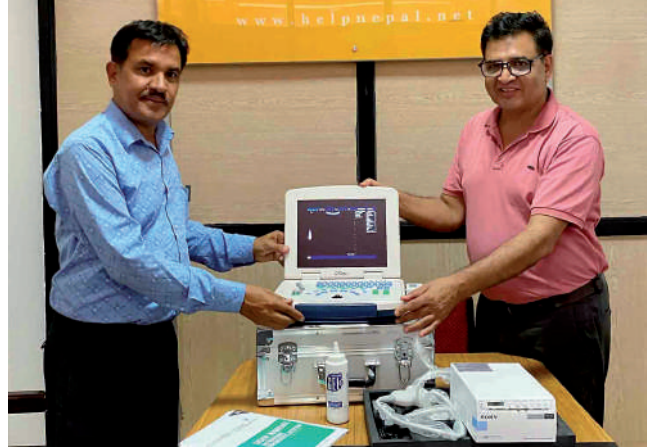
Medical Equipments Supported For BarBardiya Nagar Hospital, Bardiya