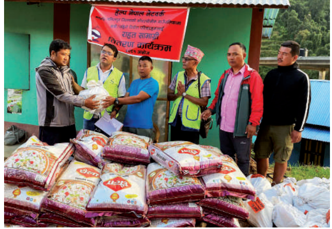
Distribution of Relief Package for flood & Landslides victims in Konjyosom, Lalitpur