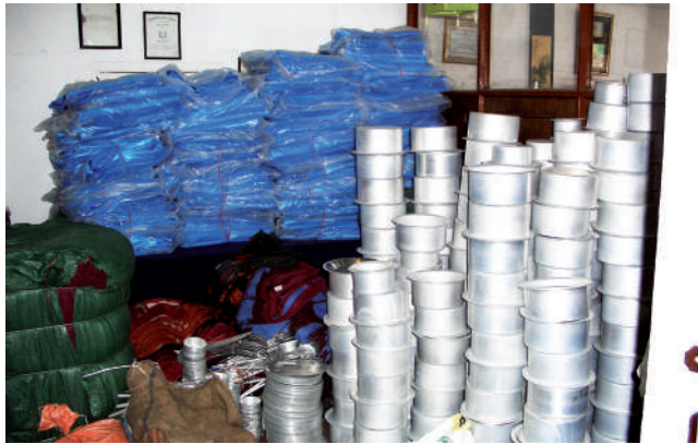
Relief Materials for Flood Victims