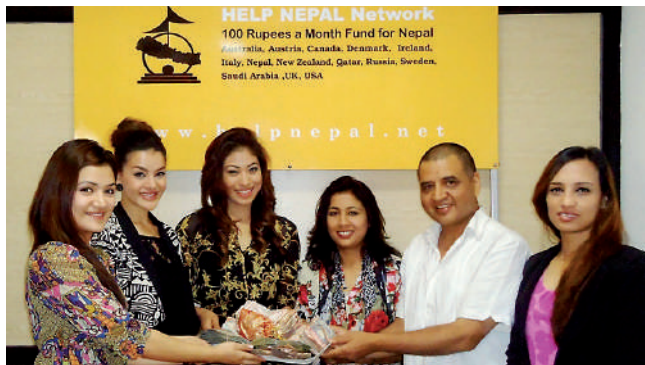
Former Miss Nepal Money Handover