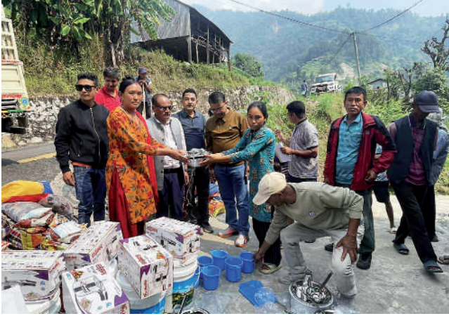
Distribution of Relief Package for flood & Landslides victims in Mandandeupur, Kavre