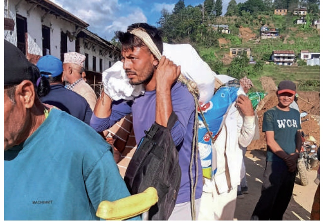
Relief Package for Flood & Landslide Victims in Kavre