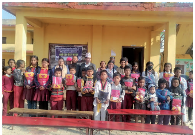
Warm clothes distribution to marginalised students of Dang