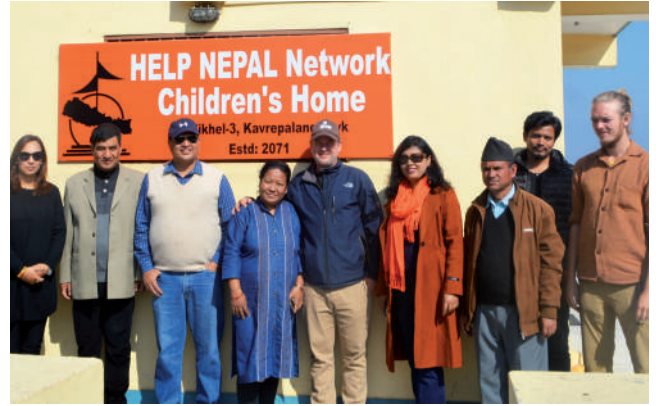
HELP NEPAL Network Children's Home, Dhulikhel