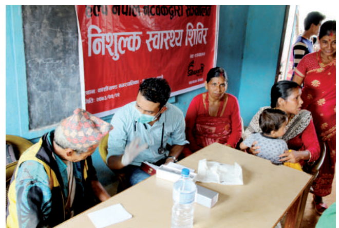
Free Health Camp, Kavre