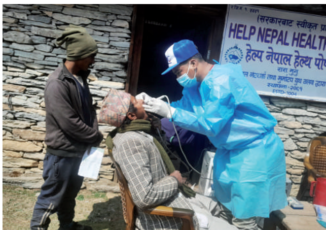
Dental Camp at HeNN Health Post, Mugu