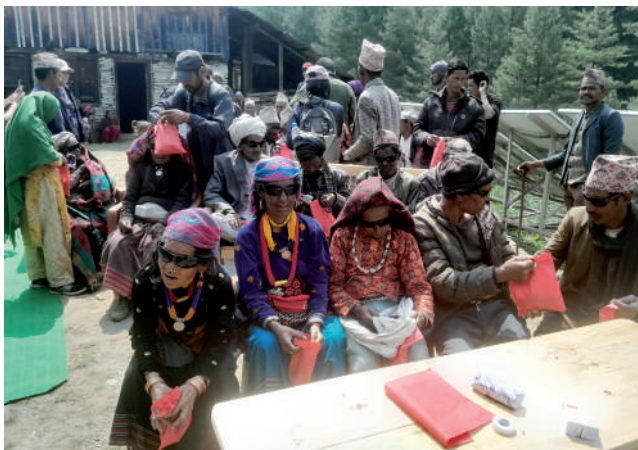
Cataract Surgeries Conducted at HeNN Health Post, Mugu