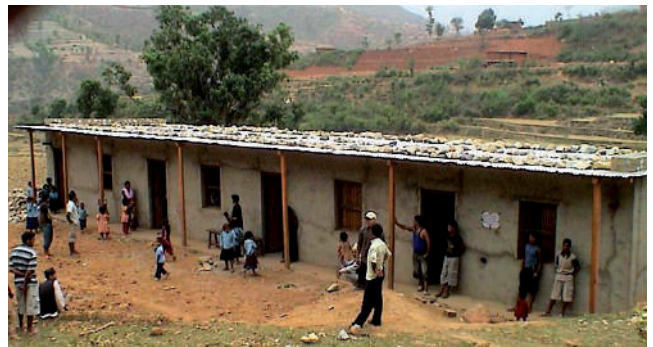
Saraswoti Primary School, Salyan- After Construction