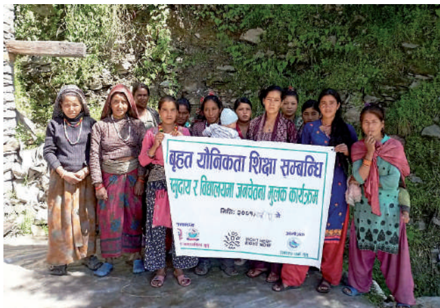
Awarness program about Child Marriage in Mugu