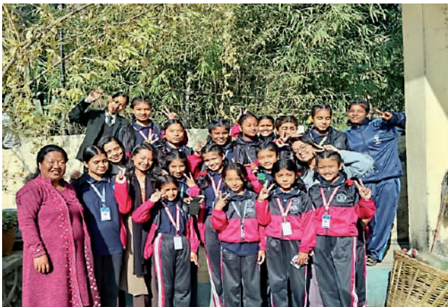
Children's Home, Dhulikhel

अर्को सुअवसर मलाई २०७१ सालमा मिल्यो। हेल्प नेपाल नेटवर्क नेपालले धुलिखेल नगरपालिका वडा नम्बर ३ मा सञ्चालन गरेको बालगृहमा व्यवस्थापकको भूमिकामा रही बालगृह सञ्चालन गर्न मलाई जिम्मेवारी दिईयो। यस बाल गृहमा आवसीय रुपमा छोरीहरू मात्र राखिएको छ। उनीहरू बालगृहमा बसेर नजिकैको पञ्चकन्या आधारभूत विद्यालयमा अध्ययन गर्छन्। अष्टम कक्षा उत्तीर्ण भएपछि धुलिखेल न.पा. ७ स्थित सञ्जीवनी नमुना माध्यमिक विद्यालयमा कक्षा १२ सम्म अध्ययन गर्छन्। कक्षा १२ पछि उनीहरू बालगृहबाट विदाई हुन्छन्। यसरी विदाई भएका दुईजना छोरीहरू आय आर्जन गर्दै पढ्दै गरी उच्च शिक्षा हासिल गरिरहेका छन्। हाल बालगृहमा देशका विभिन्न जिल्लाबाट आएका २४ जना छोरीहरू आश्रित छन्। कति छोरीहरू सानैमा मातृ वासल्यबाट वञ्चित भएका छन्। उनीहरूलाई मातृ वासल्यता प्रदान गर्नु मेरो दायित्व हो। बालिकाहरू र मेरो सम्बन्ध आमा छोरीको रहेको छ। उनीहरू मलाई आमा भनेर सम्बोधन गर्छन्, म छोरी भनेर त्यत्तिकै माया गर्छु। हामीमा आमाछोरी जस्तै नड र मासुको सम्बन्ध रहेको छ। आमा शब्दले म आह्लादित हुन्छु। आमा छोरीको सम्बन्ध प्रघाढ रहेको छ। मेरो नियति यस्तै रहेछ, सायद ईश्वरले मलाई कुनै न कुनै रुपमा समाजबाट अपहेलित नियतिले ठगेका बालबालिकाहरूको सेवा सुरक्षामा खटाएछु क्यारे। बाल गृहमा कतिन्जेल सेवा दिन सक्छु, कति नयाँ नयाँ छोरीहरू आउलान्, उनीहरूको आमा बन्ने अवसर मलाई नै प्राप्त हुनेछ। यसमा म खुसी छु। आनन्दित छु। मैले विवाह नगरेर छोराछोरी नजन्माएर के भो र मेरो लागि हुँदैछन् पछि पनि हुनेछन् मैले नजन्माएका छोरीहरू।