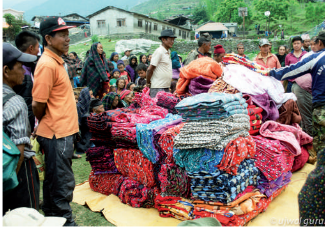
Earthquake Relief For Dhading