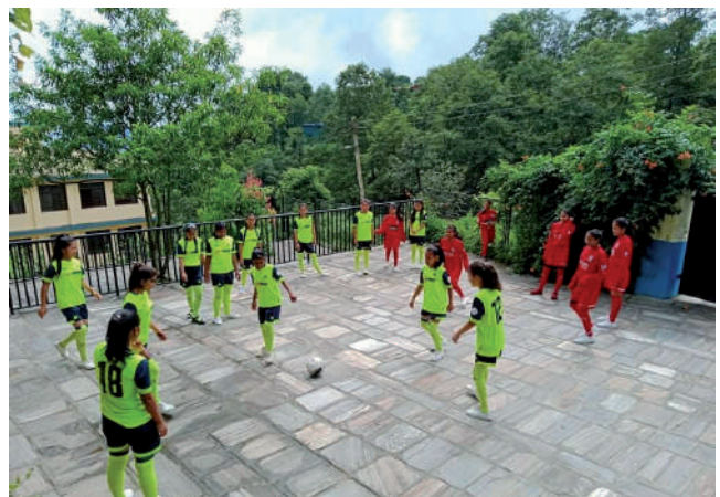
Football Training for Girls