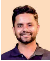
By Niket Paudel

In 2015, Nepal was shaken to its core. The magnitude 7.8 earthquake that struck on April 25 left thousands of families devastated, their lives disrupted in an instant. As the ground trembled and buildings crumbled, a nation found itself confronting the painful realities of loss and displacement. But amidst the destruction, one thing became clear: Nepal's strength was in its people. It was during this turbulent time that I, a 17-year-old, had the opportunity to work with Help Nepal Network (HeNN) and witness firsthand how communities could come together to rebuild what was lost.