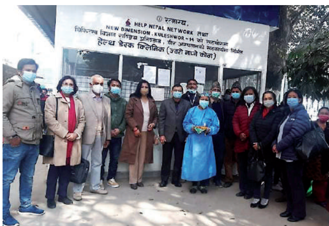
Covid Centre Set up at the Bir Hospital, Kathmandu

This year it has reached 25 years and it is a time to celebrate and highlight its achievements over the last twenty-five years. We also have many milestones to celebrate.