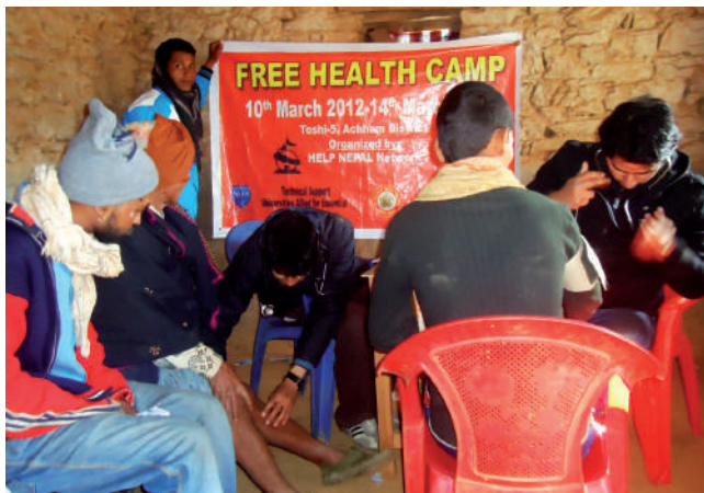
Free Health Camp, Achham