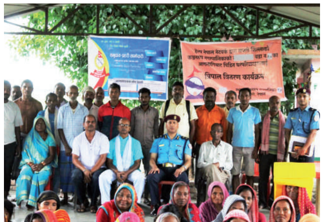
Tampoline for Flood Victims in Saptrai District