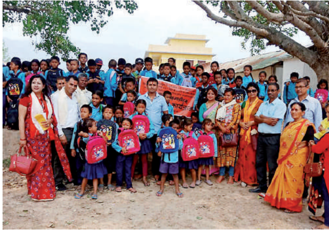
School Bags and Stationery Distribution in Saraswati Ma. Bi. School, Sankhatar Sindhuli