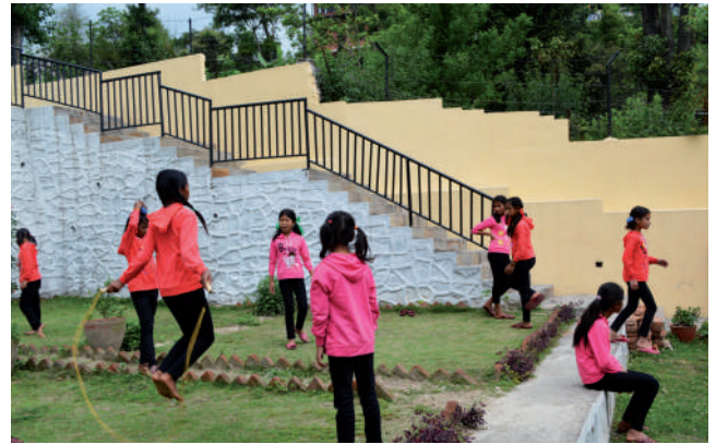
Girls Playing at the Children's Home, Dhulikhel