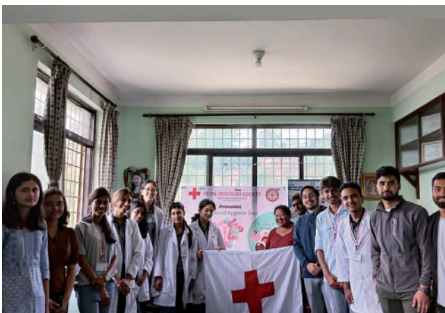
Students of Red Cross Society from Kathmandu University visited Children's Home for Menstruation Awareness