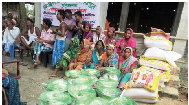
Flood Relief Package Distribution in Jhapa