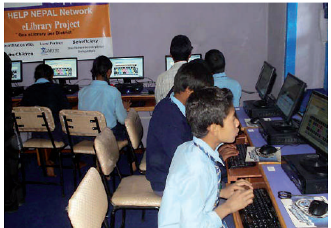
Shree Raithane Secondary School, Sindhupalchowk