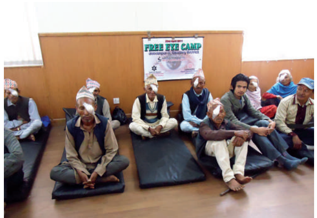
Free Eye Camp, Dhading