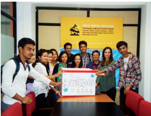
Clothes Donation to Hatemalo Foundation

Looking ahead, HeNN is committed to scaling up its programs, improving healthcare infrastructure, and ensuring that its health interventions are both sustainable and adaptable to the changing needs of the communities it serves. Through capacity building, awareness campaigns, and strategic partnerships, HeNN has empowered communities to take control of their own health and well-being. The Dhulikhel Children’s Home further exemplifies the organization’s holistic approach to health, nurturing the future generation while promoting essential health practices. As the organization continues to expand its reach and impact, its work remains a evidence to the power of collective action in transforming lives and building a healthier future for Nepal.