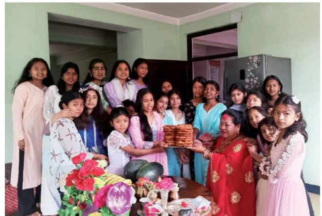
Children Celebrating Mother's Day