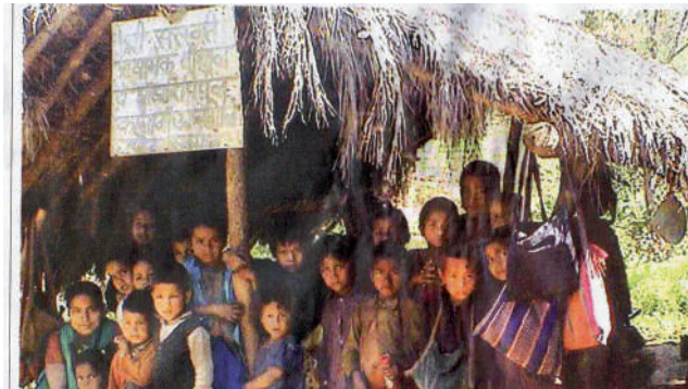
Saraswoti Primary School, Salyan- Before Construction