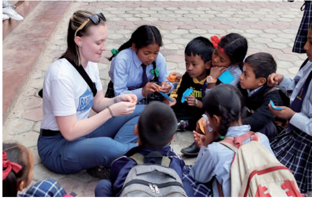
Students of Rajkhuleshowr Lower Secondary School, Dolakha