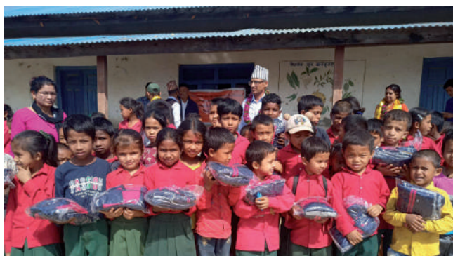
Tracksuit Support to students of Shree Saraswati Basic School, Pyuthan