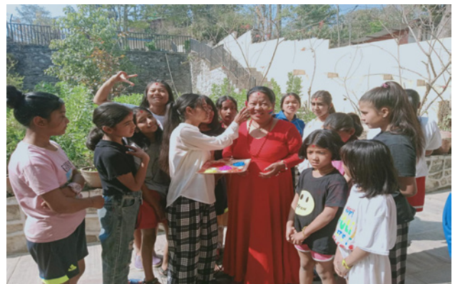
Holi celebration at the Help Nepal Network Children's Home