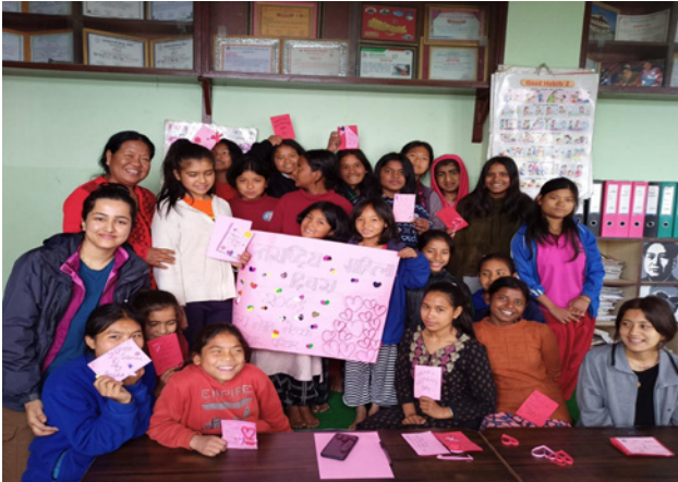
International Women's Day celebration