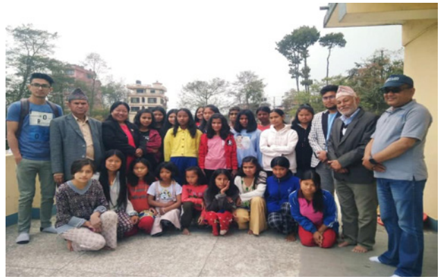
Visit and Financial support from students and teachers of Babylon National School, New Baneswor