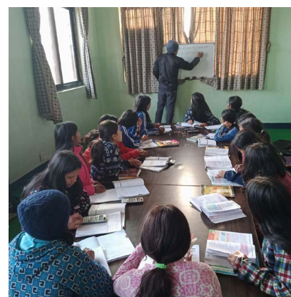
Children attending the regular tuition class

tour to Pokhara and Sauraha. During her trip, she visited the irrigation canal of Sauraha, did jeep safari in Chitwan National Park, similarly in Pokhara she witnessed Seti River Dam, Davis Fall, Mahendra Cave, and Gupteswori Cave. On her last day of trip, she went to Bindhyabasini Temple by boating in Begnas Lake. The trip was full of excitement and learning for her, as she observed many historical places and conservation areas around Sauraha and Pokhara. Overall, the children's home is running smoothly with the support of our generous donors.