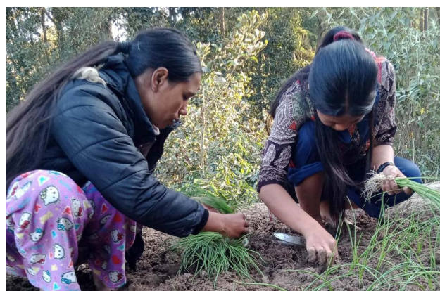
Children planting vegetables in the field