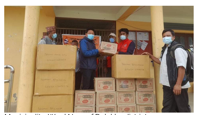
Municipality, Ward No. 3 of Dolakha district.

On 8th June, 2021, Help Nepal Network (Nepal) handed over 2016 pieces of soap and 2,500 pieces of mask to Loktantrik Yuwa Sanjal. The relief packages were distributed in Tamakoshi Rural