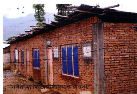
Completed school building, Gorkha

HeNN contributed a total of US$4,860 to Jeevan Jyoti Lower Secondary school in Gorkha for the construction of a new school building in order to replace the old one that was in a dilapidated condition and inaccessible to students. The construction of the school building is now complete.