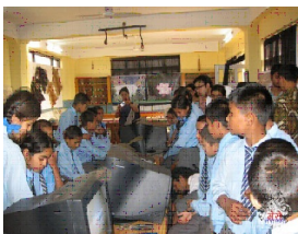
Ganesh Secondary School, Baglung

HeNN contributed a total of US$4,160 to Ganesh Secondary School in Baglung to construct a new roof. This project was carried out in partnership with the local community and is now complete.