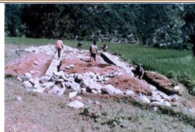
And the foundation is being laid down