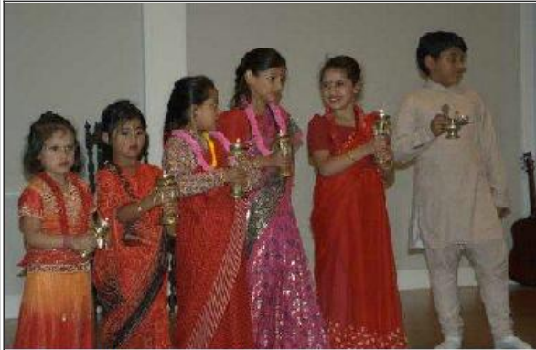
Children (Pancha Kanya) line up to welcome the guests of Help Nepal International Day in USA.