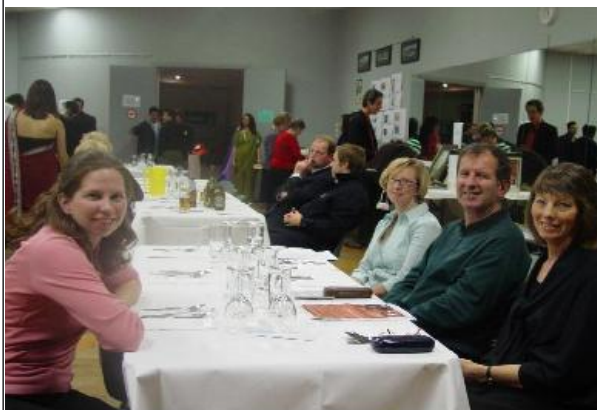
Help Nepal International Day celebration in Melbourne.