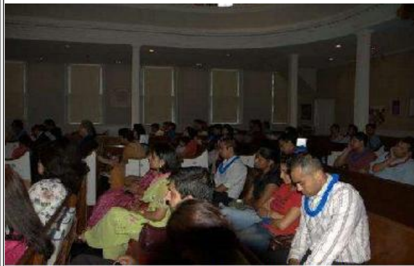
Participants of Help Nepal International Day in USA.