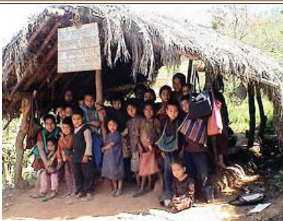
This is the school that is being rebuilt

Help Nepal Network had reacted by deciding to release Rs. 3,00,000 ($4,225) when Kantipur daily published an article about the dilapidated condition of Sarswati Primary school in Ghanjhari Pipal-8, Salyan. The project is now in progress. Three ropanies of land has been bought. Wooden work such as construction of doors, windows etc. have also been completed. Among 24 houses present in the vicinity of the school, members of each house have generously accepted to provide labor work for 15 days.