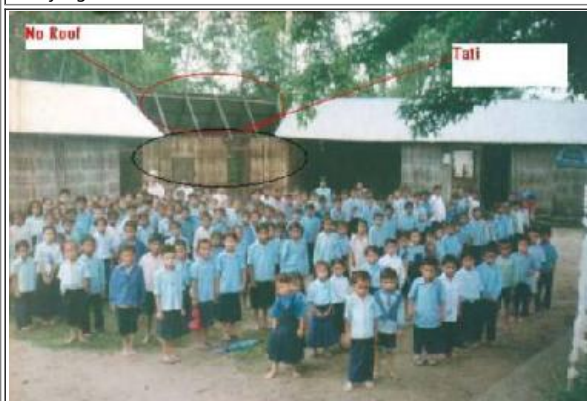
Children lining up in front of dilapidated school building

The construction of Rana Devi Primary School in Panchakanya Village Development Committee, Ward No. 1, Sunsari District is now in full swing. HeNN contributed Rs. 2,20,000 (US$ 3136) out of a total of Rs. 7,31,556.58 (US$ 10428) estimated for the project. The project is expected to provide decent school environment for 5 teachers and 205 students who are currently studying in this school.