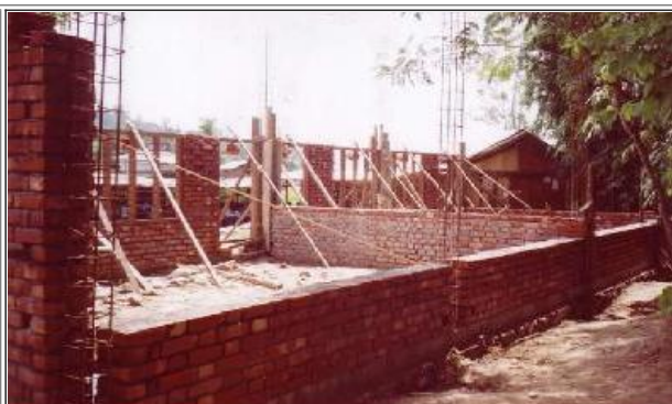
A new construction being carried out for the school.