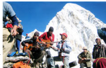
Setting world record: Members of 'The Hidden Band' and others performing at Kala Pattar above the Everest Base Camp last month

Help Nepal extends its congratulations to the musicians for achieving their set goal and in the process helping children in Nepal.