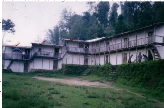
This school building will be re-constructed.

The re-construction work is expected to finish in two from its start date. The school was established in 2008 B.S (1951 A.D.). It is presently providing education to students up to class 12. Altogether there are 687 students studying in this school.