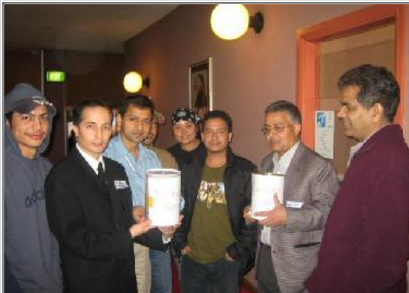
HeNN-Australia team in Sydney pose for a photograph after fund collection during Help Nepal International Day in Sydney.