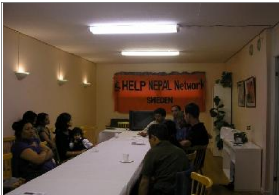
Help Nepal International Day celebration in Sweden.

HeNN-Sweden celebrated Help Nepal International day on 24th September, 2005. Around 20 people participated in the program which included local Swedish people as well. The meeting included screening of HeNN Documentary-2005 along with the discussion for registration of HeNN-Sweden as a charity organization. The meeting was successful in collecting 360 Euro. A representative from Swedish-Nepal Society informed the decision of the society to donate 200 Euro to HeNN annually.