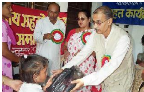
In the initial phase some study materials were distributed to the children.