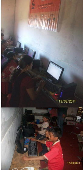
Shree Janakalyan Rastriya Prathamic Vidyalaya, Nawalparasi