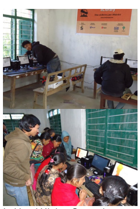
Lekhani Higher Secondary School, Baglung

Improving the education sector in Nepal is a major objective of HeNN and Save the Children. Their joint initiative to support e-Libraries was bolstered by the entry of Ncell, a leading telecom service provider in Nepal. Ncell has provided USD 27,575.62 for the deployment of five e-Libraries in five districts - Baglung, Sindhupalchowk, Siraha, Nawalparasi, and Kailali. While Save the Children is coordinating the project, HeNN is the implementing partner.