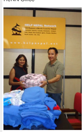
Donation to Cloth Bank Nepal, Kathmandu