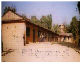
Shree Saraswati Higher Secondary School, Gulmi

The construction of the new building is expected to be completed by April 2010.