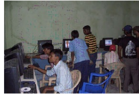
Shri Bhola Higher Secondary School, Bara