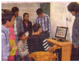
Shri Simpani Higher Secondary School, Khotang

HeNN contributed USD 5,000.00 to set up the e-Library in October 2009, which is fully functional with 11 computers and a server