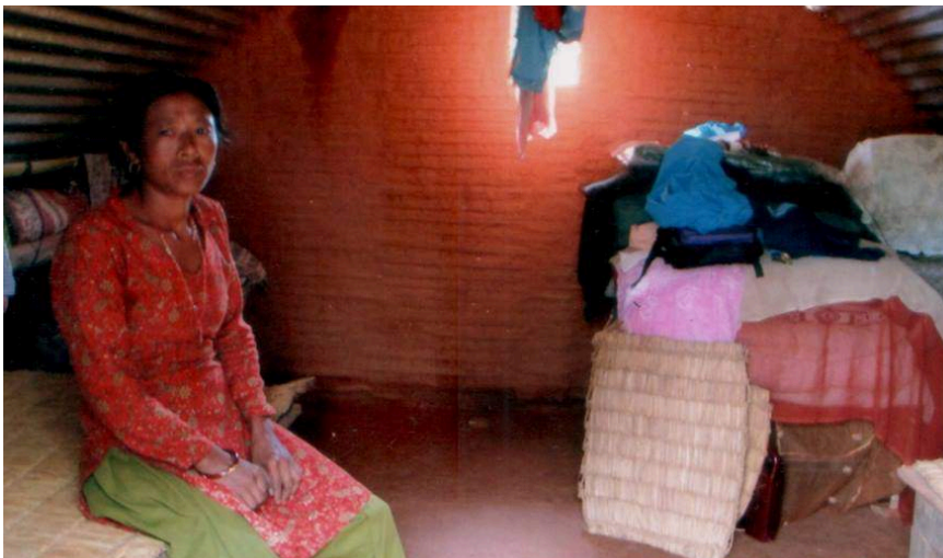
Figure 2. Temporary Shelter