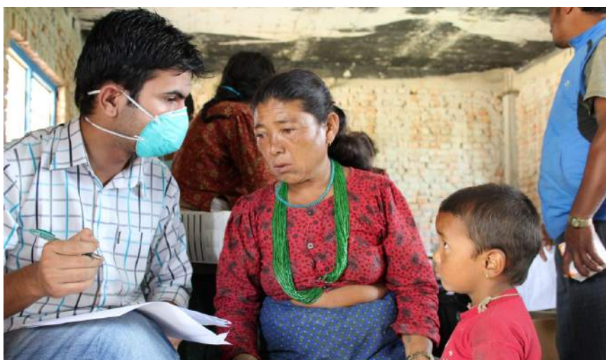
Figure 4. Health Camps

HELP NEPAL Network is working with the Department of Education to redesign schools damaged by the earthquake. Several schools have been selected in Sindhupalchowk and Nuwakot for reconstruction, and the initial design and costing phase is underway. We plan to complete this phase and begin the reconstruction work in the coming months. Our reconstruction work in 2016 will primarily focus on rebuilding schools.